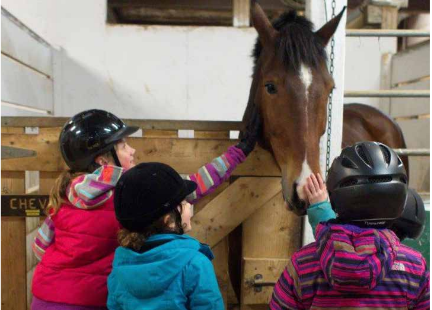
Chevy enjoying the attention of younger riders.

Lancers will offer a March Break Camp from March 14 -18 for 8-12 year olds. Camp times are 9:00 am – 4:00 pm. The cost is $300 including HST. An early drop off or late pick option will be available at a charge of $5.00 per day. To register for the camp please visit our website www.bengallancers.com , download and fill out the March break camp application and provide a $50.00 cheque to secure a spot in the session. Space is limited to 12 riders and registrants will be accepted on a first come first served basis. Campers will learn to groom and tack up, as well as the fundamentals of walking and trotting. While not riding, riders have in-barn lessons where they learn the parts of the horse and important barn rules. Please tell your friends who have children who are interested in learning to ride!