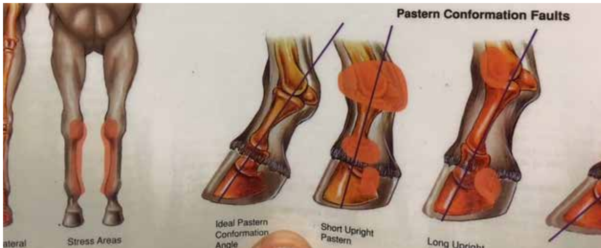
Pastern Conformation Diagram